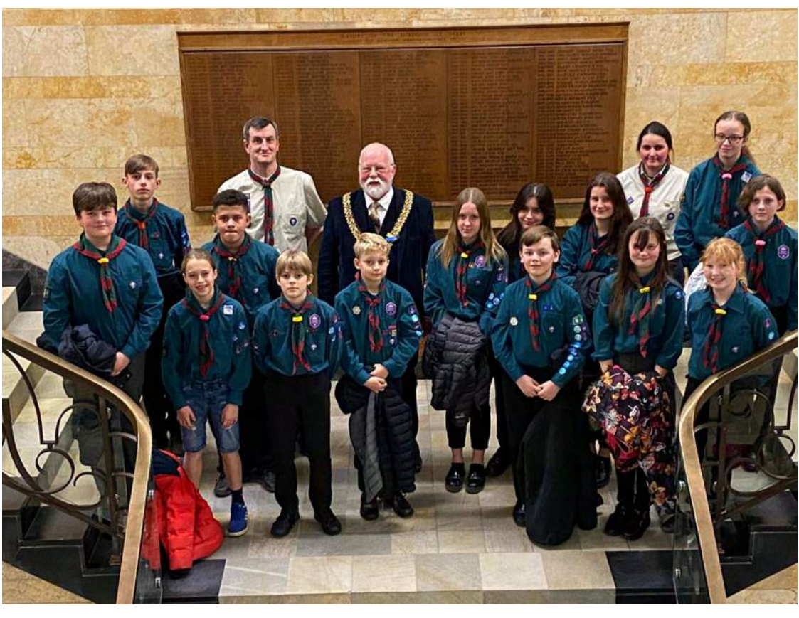
This was earlier in the month when the scouts visited the mayors' chambers.