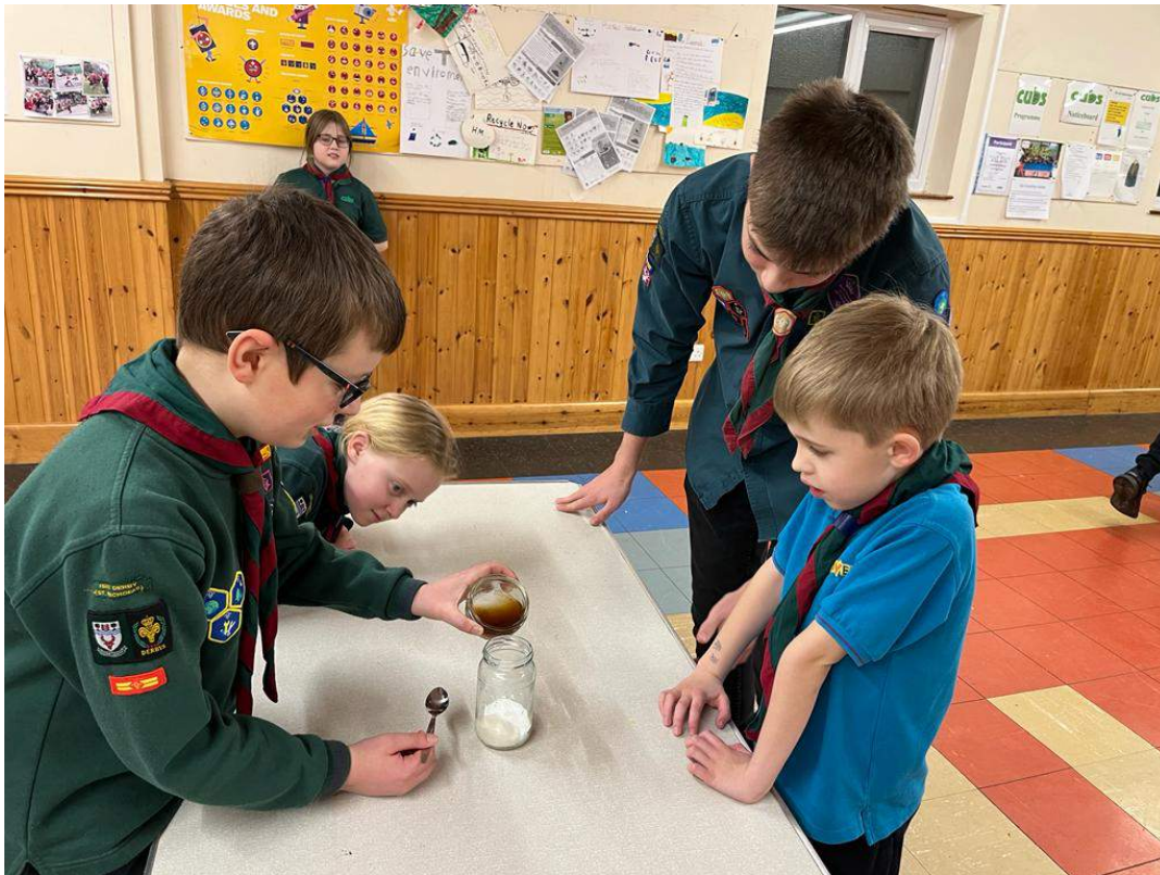
Here are the cubs being helped by our young leaders with science experiments. This one is the coke and mentos experiment which "BLOWS UP"