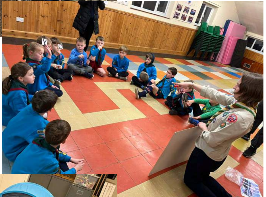
This was when the Derbyshire Archaeology team had come to visit to run a great interactive session working towards their archaeology badge.