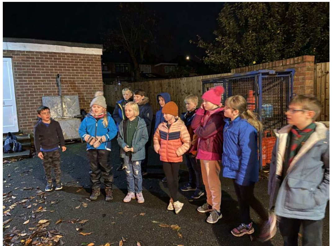
Here are the cub's roasting marshmallows and singing campfire songs.