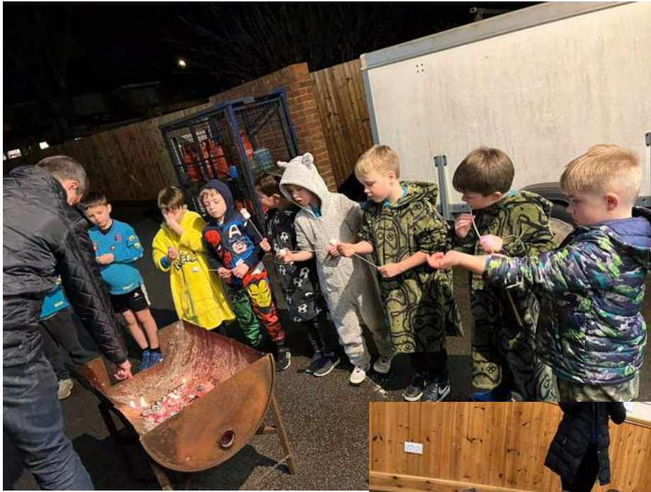
Here are the beavers and a Pikachu around the campfire toasting their marshmallows.