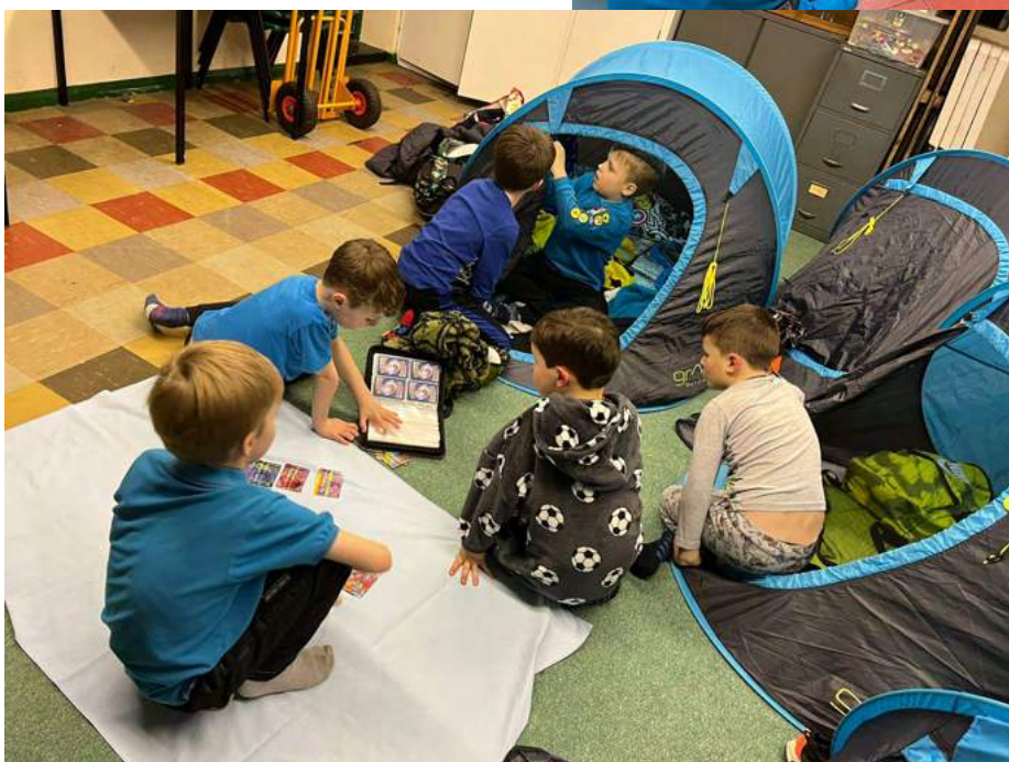
This is our Beaver colony in their pop-up-tents during their sleepover.