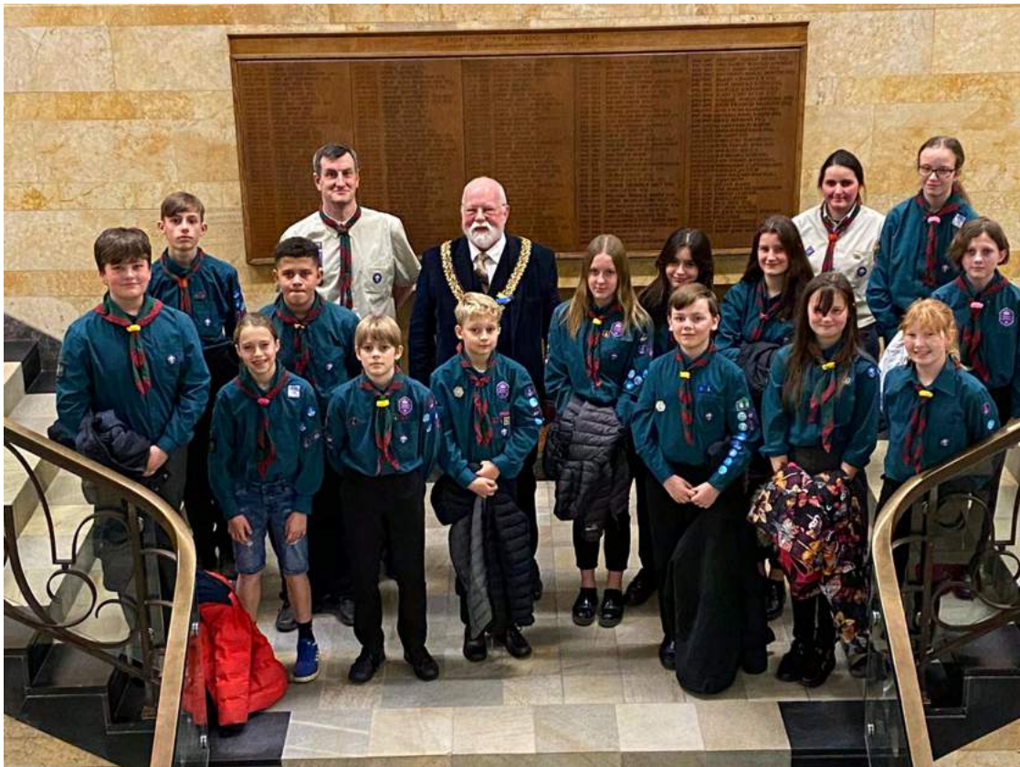
This was earlier in the month when the scouts visited the mayors' chambers.